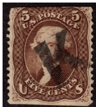
LS-K 1A 1863