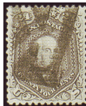
LS-K 10 Chicago, IL 1867