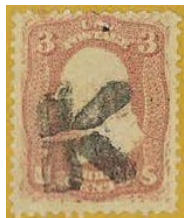
LS-K 3 Kokomo, IN 1869