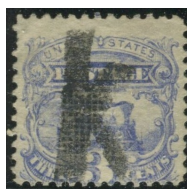
LS-K 2 Bristol, RI 7/20/1869?