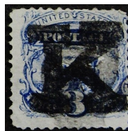
LS-K 6 [USCC 5869] Kirkland, NY 1869