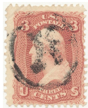
LS-K 7A 1867