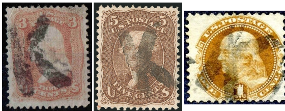
LS-K 4 Bristol, RI 1867-1869