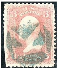
LS-K 9 blue [USCC 5884] Keene, NH 1861