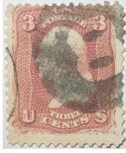
NS-H 4A [Blake/Davis 1025] late usage Boston, MA 1861