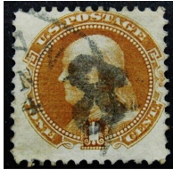
NS-H 3A Albany, NY(?) 1869