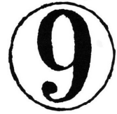
NS-I 1 Chicago, IL 1861