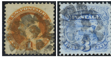
NS-H 4 Detroit, MI 8/31/1869