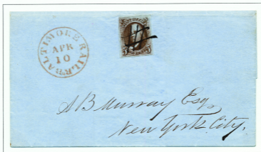
SLIP PRINTING - DOUBLING OF THE ALL THE LETTERING PEN CANCEL AND RED "BALTIMORE RAILR" POSTMARK BROWN