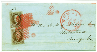
TYPE "E" ? DOUBLE TRANSFER "MOWER SHIFT" IN UPPER STAMP, ONLY KNOWN VERTICAL PAIR SHOWING THIS VARIETY, RED SQUARE N.Y. GRID CANCEL BROWN