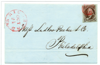
SLIP PRINTING - DOUBLING OF THE ALL THE LETTERING AND FRAME LINES

SLIP PRINTING - ALSO CALLED A "DOUBLE PRINT" OR "KISS IMPRESSION". CAUSED WHEN THE SHEET SLIPS MOMENTARILY DURING PRINTING, CREATING A DOUBLING OF THE IMPRESSION. NOTICE THE DOUBLING OF THE "5'S", "FIVE CENTS" AND THE TOP FRAME LINE.