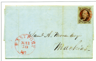
PLATE CRACK, "T" WITH BROKEN LEFT ARM - MISSING TICK MARK FROM THE 3RD DELIVERY, POSTMARK DATED "MAY 10" AND FOLDED LETTER DATED "MAY .. 1849" ON FOLDED LETTER, RED GRID CANCEL AND MATCHING "EASTPORT / ME" POSTMARK RED BROWN

PROOF THAT THE PLATE CRACK "T" DIMINISHED DURING THE LATER DELIVERIES