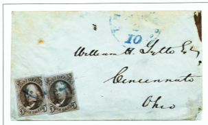
SLIP PRINTING - DOUBLING OF THE LETTERING IN "POST OFFICE" BLUE "PHILADELPHIA PA. / 10" CANCELS AND POSTMARK DARK BROWN