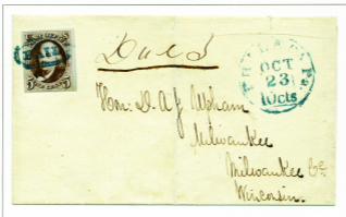
PLATE CRACK, "T" WITH BROKEN LEFT ARM, FROM THE 1ST DELIVERY POSTMARK DATED "OCT 23" AND FOLDED ADDRESS SHEET DOCKETED "1847" ON FOLDED LETTER, BLUE "PAID" IN OCTAGONAL CANCEL AND MATCHING PHILADELPHIA POSTMARK SEAL BROWN