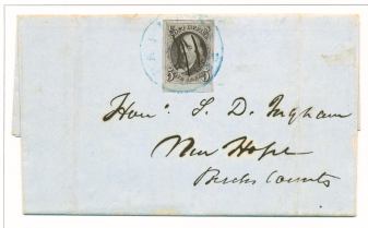
HORIZONTAL LINE AT RIGHT OF BOTTOM FRAME LINE POS. 100R, BOTTOM RIGHT PLATE SINGLE BLUE TOWN & PEN CANCEL DARK BROWN