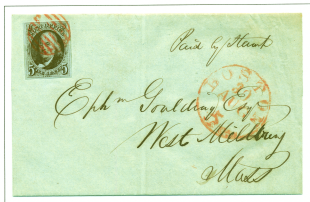
2 ND DELIVERY STAMP, USED AUGUST 30, 1848 RED CLOSED CIRCULAR GRID CANCEL BISTER