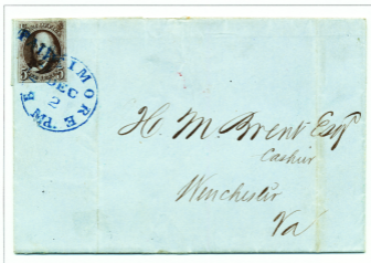
SLIP PRINTING - DOUBLING OF THE "5" IN "US" AND THE UPPER RIGHT FRAME LINE

BLUE "PAID" AND "BALTIMORE" TOWN CANCELS