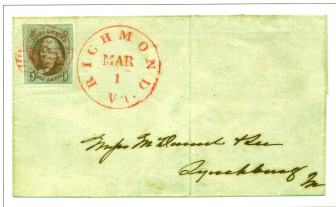
5 TH DELIVERY STAMP, USED MARCH 1, 1851 RED CLOSED CIRCULAR GRID CANCEL LIGHT REDDISH BROWN