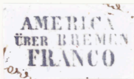
“America Über Bremen Franco” Fully Paid to Bremen Introduced with Bremen Closed Mail