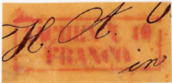
"Aachen Franco" (fully paid to Aachen) Introduced with Prussian Closed Mail