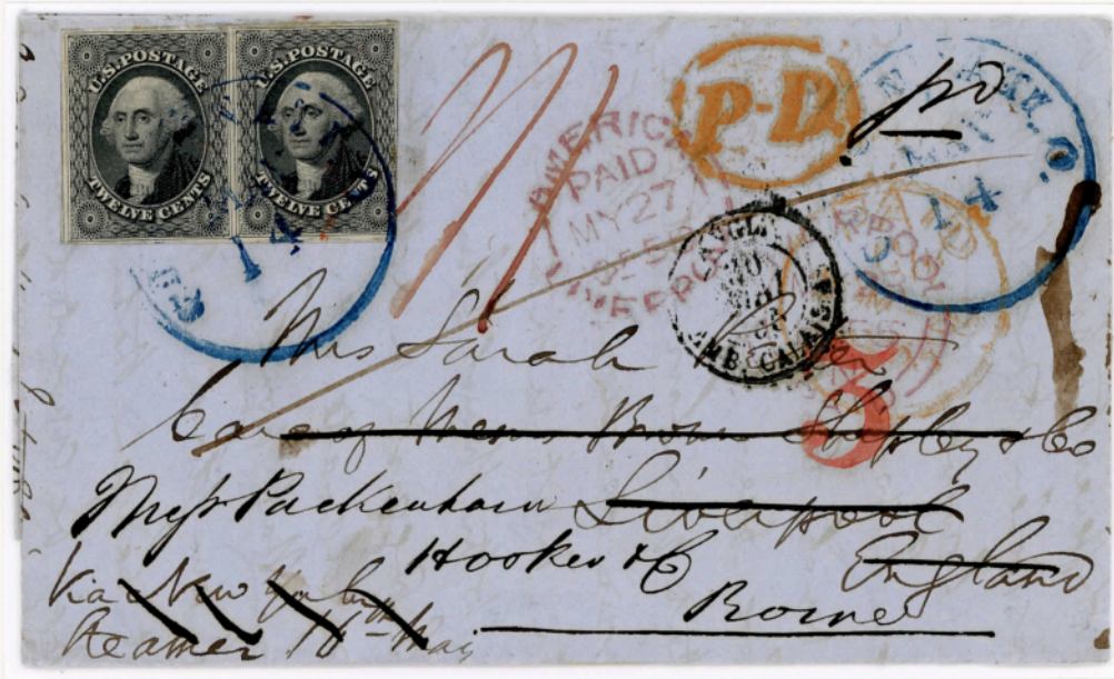
Cincinnati letter May 14, carried by Am pkt Collins Line's Atlantic Dep NY 16 May, Arr Liverpool 27 May. Proper markings and forwarded via Calais, 30 May, Arr Rome 5 June, 1855. 12c pos. 52-53L1.

Cincinnati, Ohio to Liverpool, Forwarded to Rome, Italy