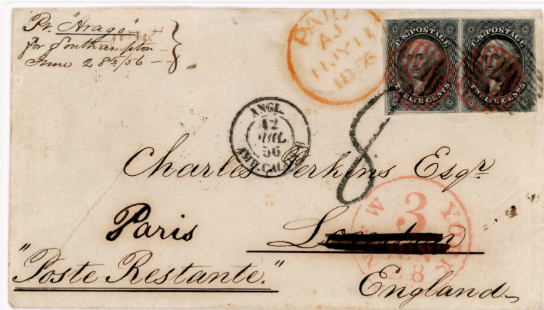
Am pkt Havre Line's Arago Dep NY 28 June, Arr Southampton 10 July, Arr London 11 July, Arr Calais 12 July, train to Paris, 12 July, 1856. RPO on reverse. 8 decimes postage due from France. 3c Am pkt credit. Pos. 15-16R1.