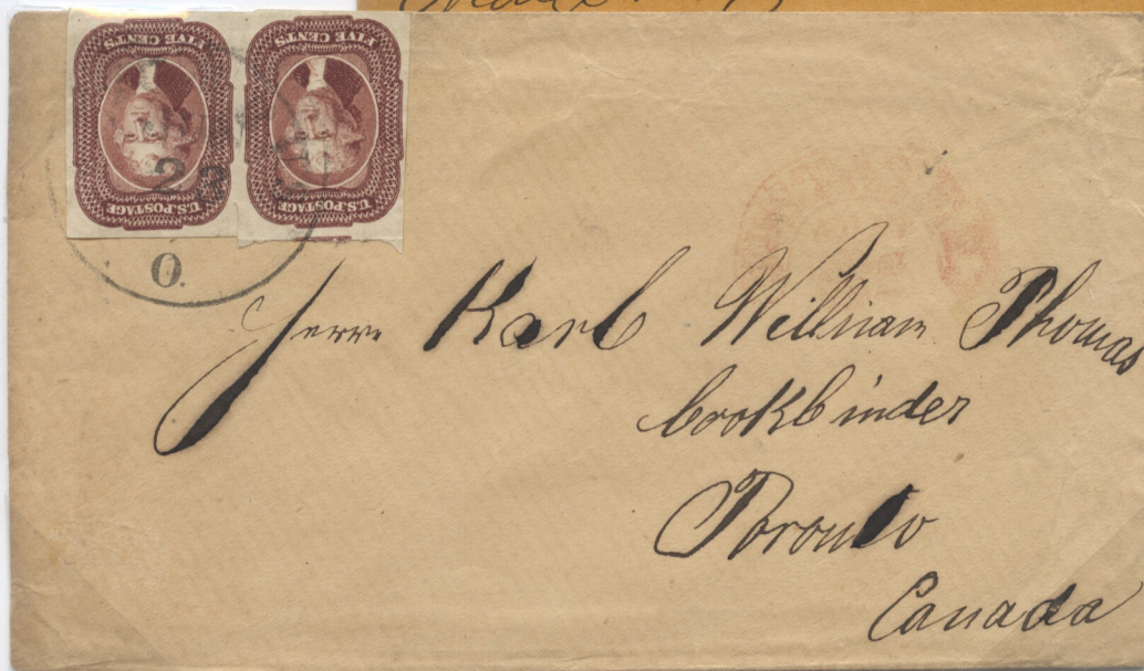
June 1856 cover from Columbus OH to Toronto Canada. Faint red 'U STATES./ PAID/6d' exchange marking. Toronto receiving mark on back.