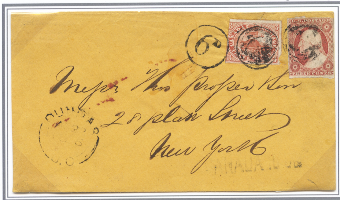
1856 cover from Dundas Canada to New York City. Canada did not recognize the United States stamp and did not accept the Canadian stamp for partial payment. '60' in circle applied in Dundas. The Canadian exchange office applied the 'CANADA 10 Cts' handstamp in black indicating 10 cents due. Position 92R3.