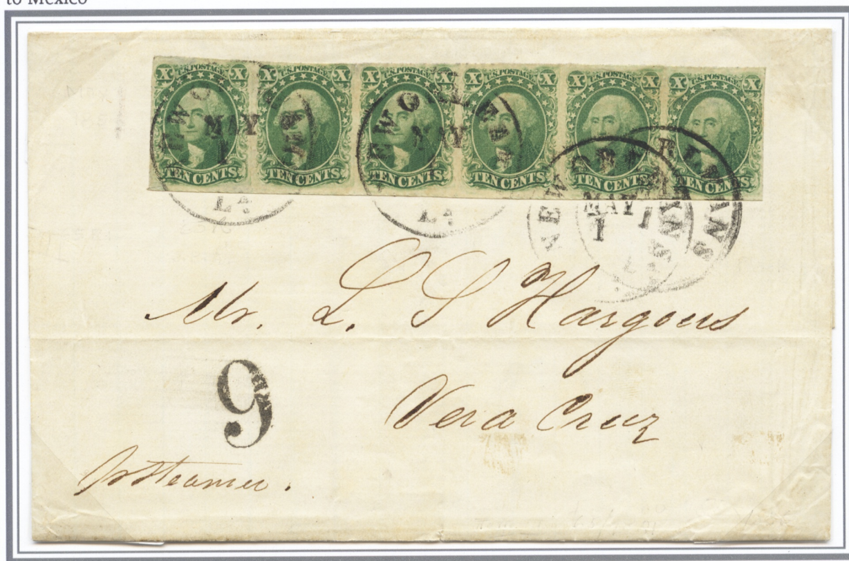
May 1856 folded address sheet from New Orleans LA to Vera Cruz Mexico. 9 reales due on delivery. Stamps all type III, Positions 65-70R paid the 6x American 10 cent Packet rate to Mexico.