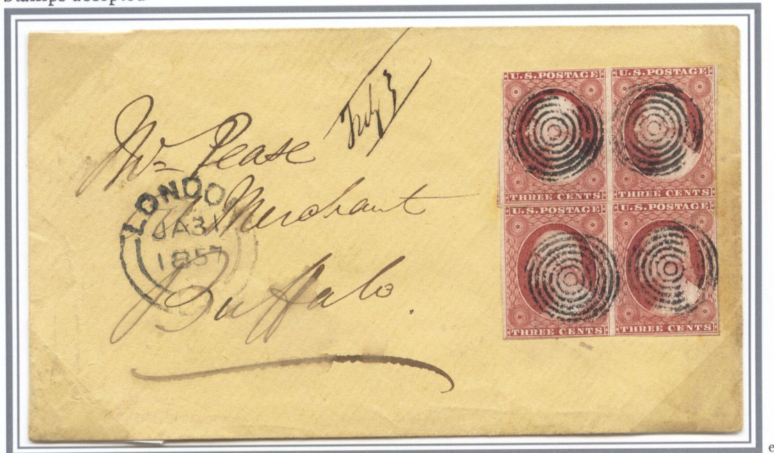
January 1857 cover from London Ontario Canada to Buffalo NY. Block of four 3 cent stamps overpaying the 10 cent rate. In violation of regulations, the stamps on this letter were accepted by both the Canadian and United States post offices.