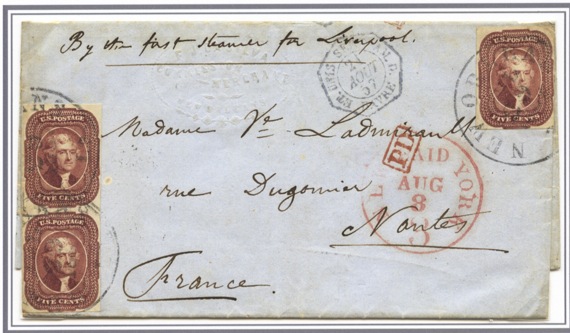
29 July 1857 folded letter from New Orleans LA to Nantes France. Stamps pay the 15 cent treaty rate. The letter was carried on the Vanderbilt Line's Ariel leaving New York 8 August arriving at Southampton 20 August. The mail was transferred to a steamer and delivered to Havre.