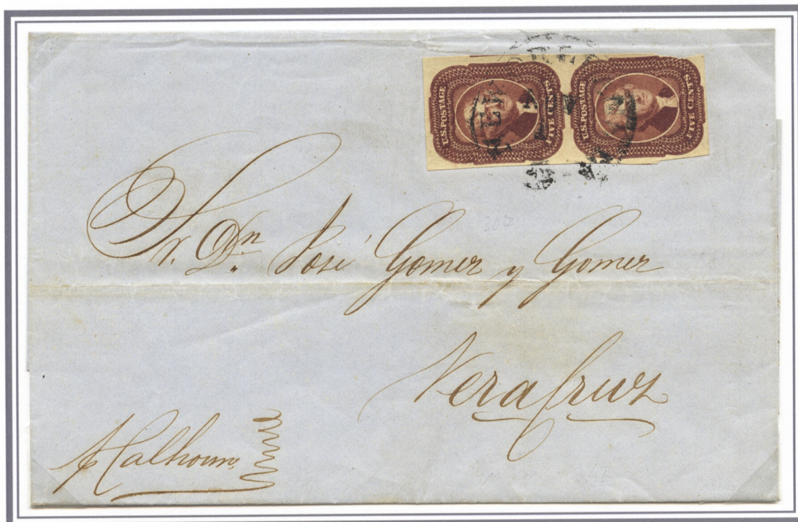
November 1856 folded address sheet to Vera Cruz. The letter was carried on the steamship Calbourn leaving New Orleans on 1 November.