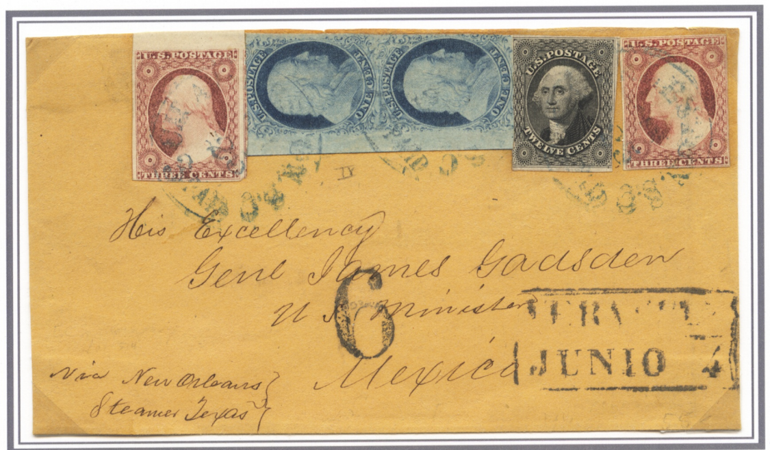
May 1853 cover front from Charleston SC to Vera Cruz Mexico. Arrived Vera Cruz 4 June on steamship Texas . 'VERA CRUZ/JUNIO 4' handstamp. 6 reales due on delivery. The stamps pay the double packet rate.