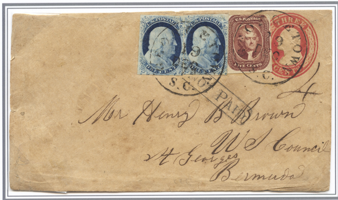
December 1856 from Georgetown SC to St. George Bermuda. Boxed 'NOT PAID' most likely applied by accident. Stamps pay 10 cent American Packet rate per 1 ounce for distances under 2,500 miles.

Only recorded cover to Bermuda bearing a 5 cent 1856 stamp.