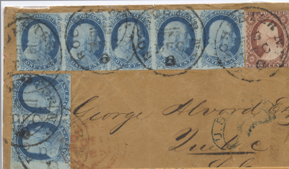
December 1851 cover from Rochester NY to Quebec Canada. Strip of five and a pair of 1 cent stamps and a 3 cent stamp orange brown type II pay the 10 cent rate. Blue ribbon style 'U States' cross-border marking and red Montreal circular date stamp. One cent stamps positions 43-47R E and positions 41-42R E .

Effective 6 April 1851 letters could be sent to or from Canada either paid through or unpaid. Partial payment was not permitted. During this period circulars were still paid 'to the lines'.