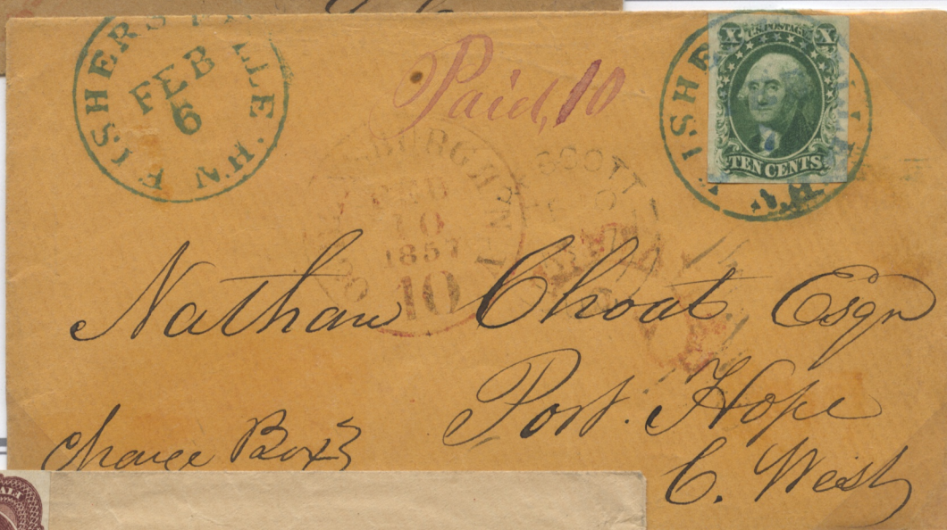
February 1857 cover from Fishersville NH to Port Hope Canada. Ogdensburg transit marking and Port Hope receiving mark on back.