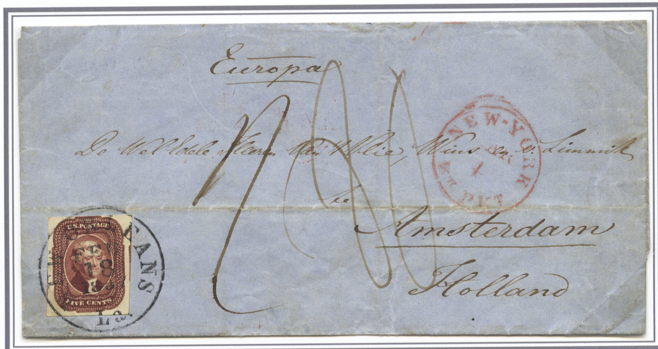
February 1857 folded address sheet from New Orleans LA to Amsterdam Holland. Sailed on Cunard Asia leaving New York on 4 March arriving in Liverpool March 16. Sender had directed the letter sail from Boston on the Europa . 1 shilling due Britain. 80 cents due on delivery. Amsterdam receiving backstamp.

1 of 2 recorded covers to Holland with 5 cent stamp.