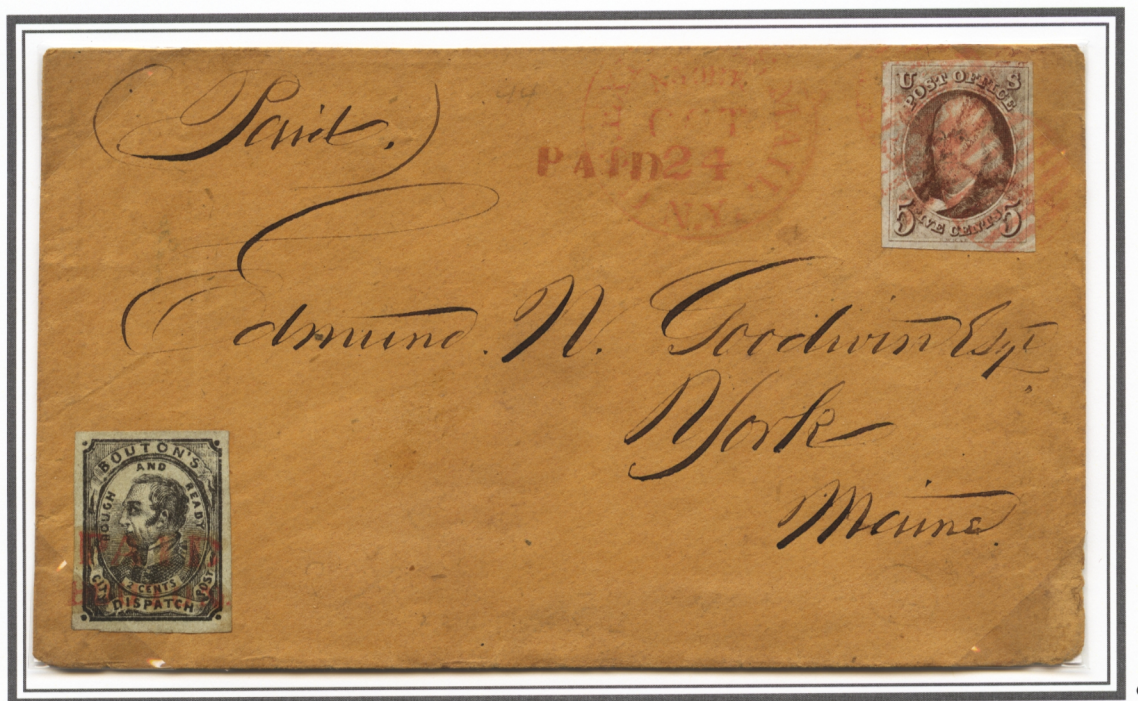
Cover from New York City to York ME. U.S. Express Mail route agent marking. Red 'PAID' at top applied by post office. Local, with corner dots (18L2), red two line 'PAID BOUTON' cancel. Bouton's delivered to the mail.

Two of eight recorded from Bouton in New York with the 1847 issue