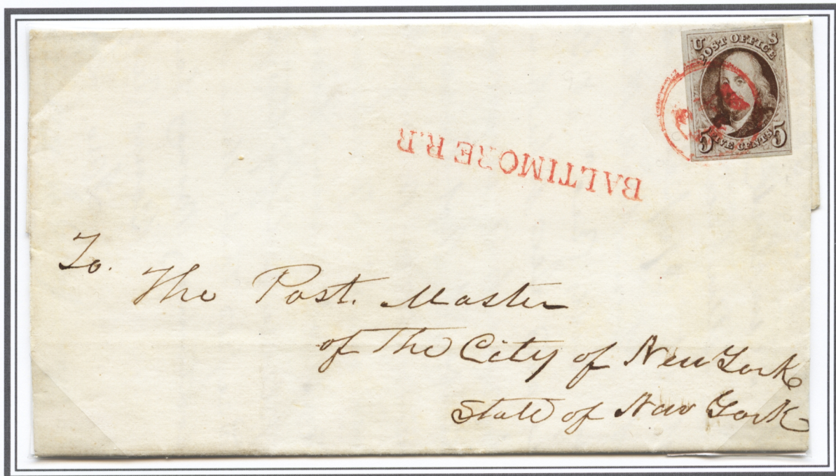
December 1848 folded letter from Harpers Ferry VA to New York City. Traveled on the Philadelphia, Wilmington & Baltimore Railroad. Red '5' in circle canceling stamp. Straight-line 'BALTIMORE R.R.' handstamp. The letter, addressed to the New York City postmaster, is about a lost letter containing money. No money was found.

Straight-line 'PHILAD A RAIL ROAD' handstamp canceling right margin copy of 5 cent stamp.