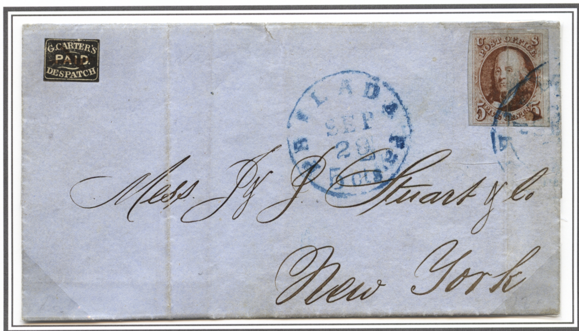
September 1849 folded address sheet from Philadelphia PA to New York City.