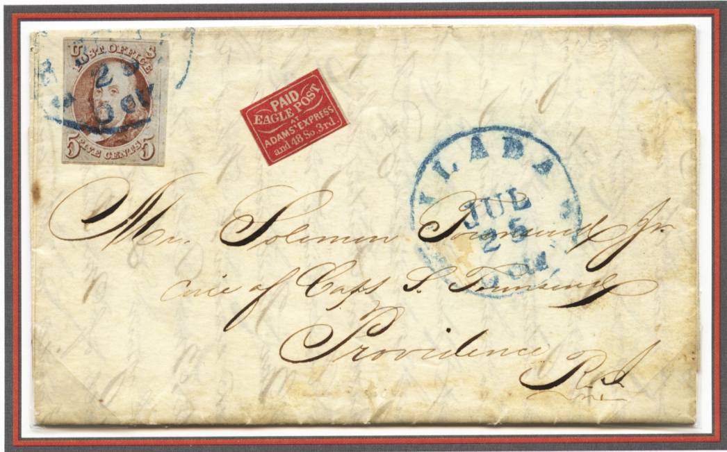
July 1850 folded letter from Philadelphia PA to Providence RI. Eagle Post stamp (61L3).

Only recorded example of Red Eagle Post local used with an 1847 stamp