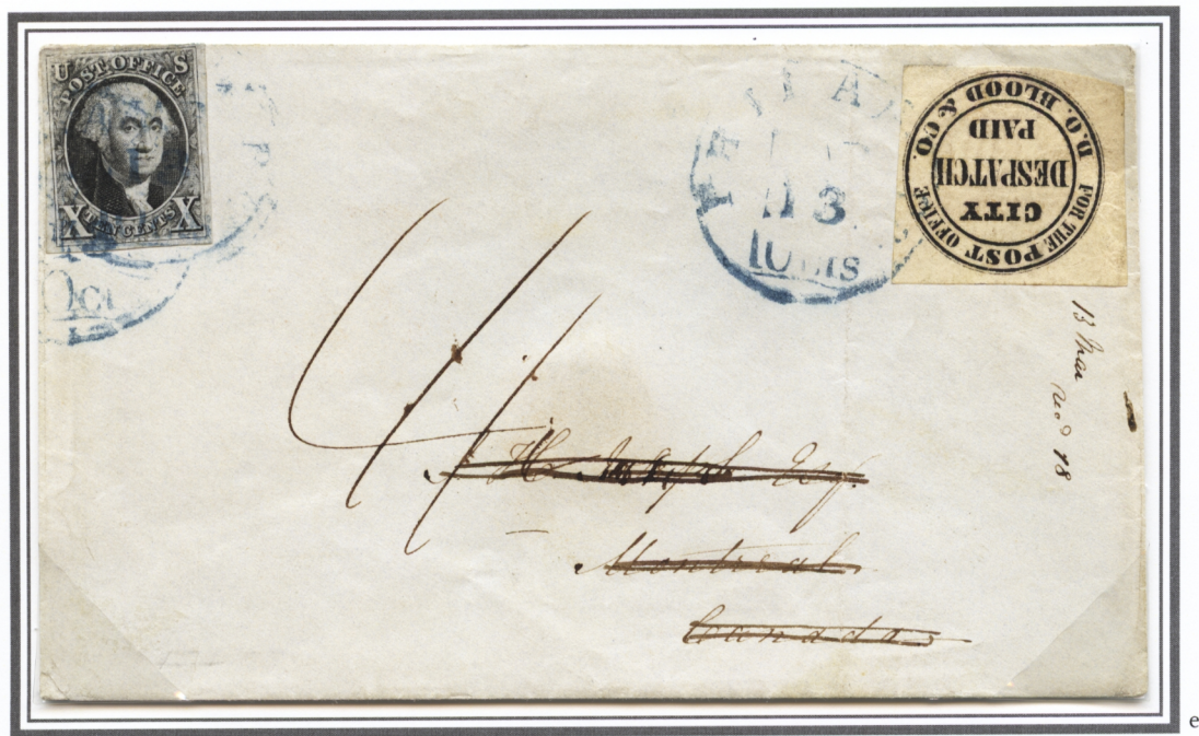
March 1849 cover from Philadelphia PA to Montreal Canada. 10 cent stamp paid to the border. Delivered to mail by Blood. Blood's stamp(15L9). 4 1/2 pence due on delivery.