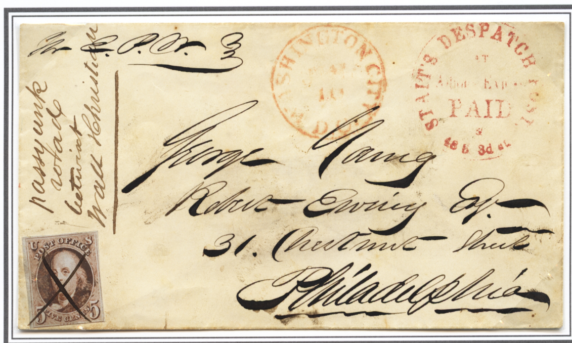
Cover from Washington City to Philadelphia. Forwarded to Passyunk Road by Strait's Despatch.