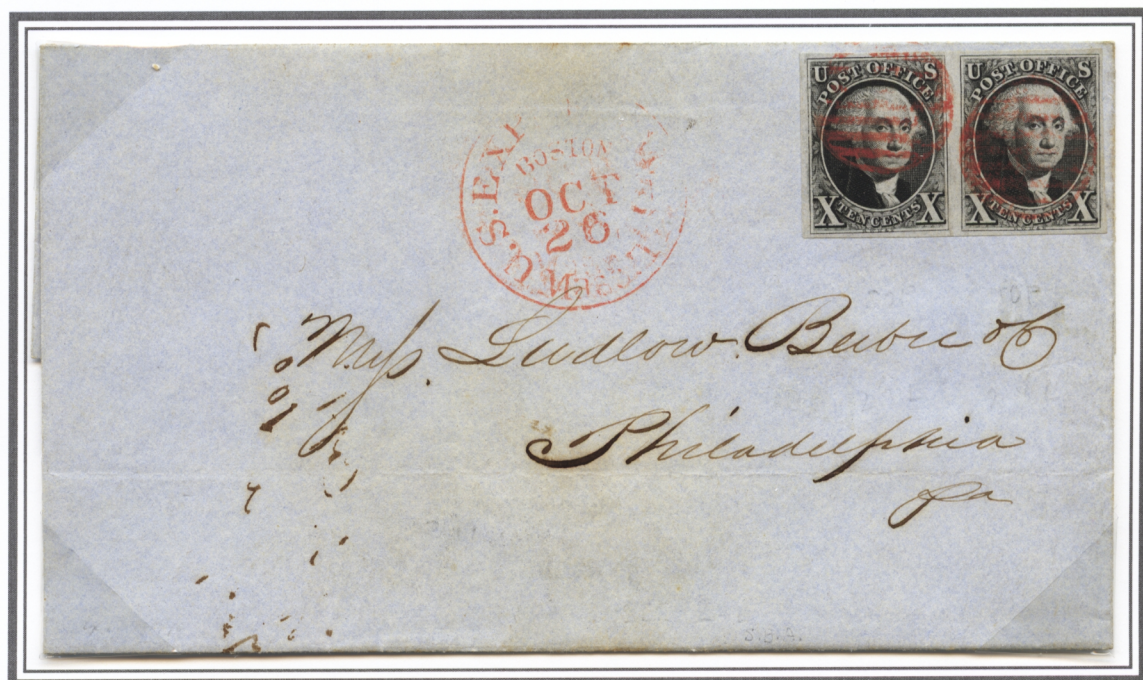
Double rate cover from Boston to Philadelphia. Entered the mail on a train from Boston to New York City. U.S. Express Mail route agent datestamp