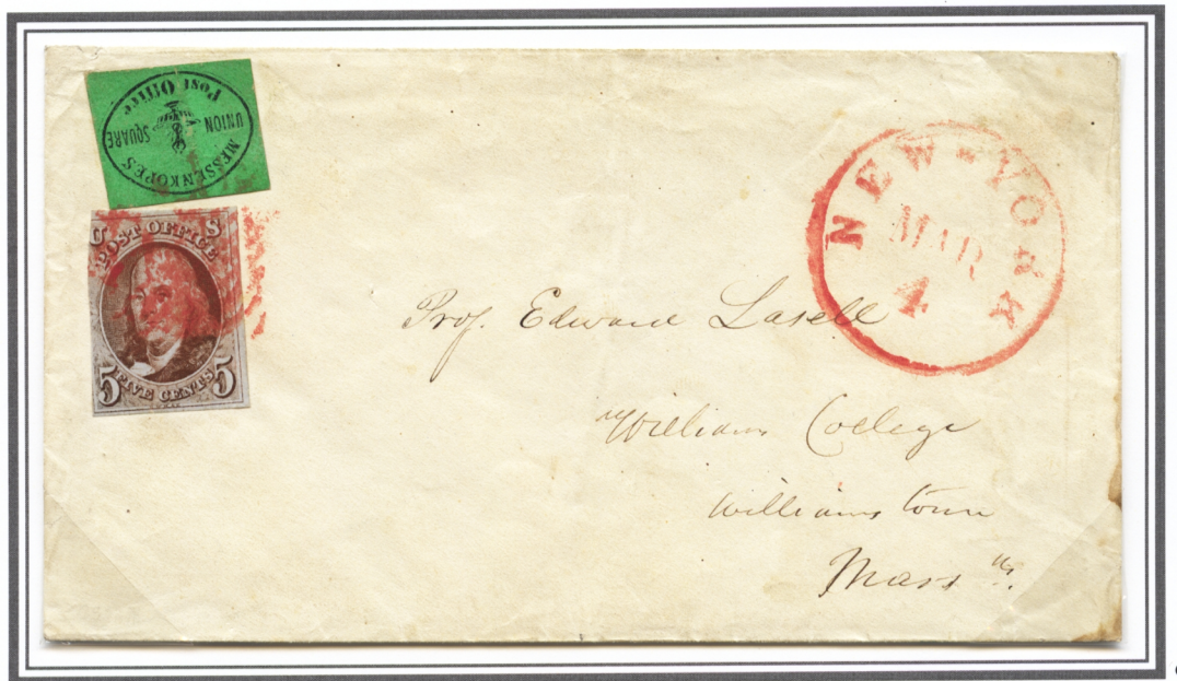
Cover from New York City to Williams Town MA. Messenkope's delivered to the mail. Local Messenkope's black (106Li) on green glazed.