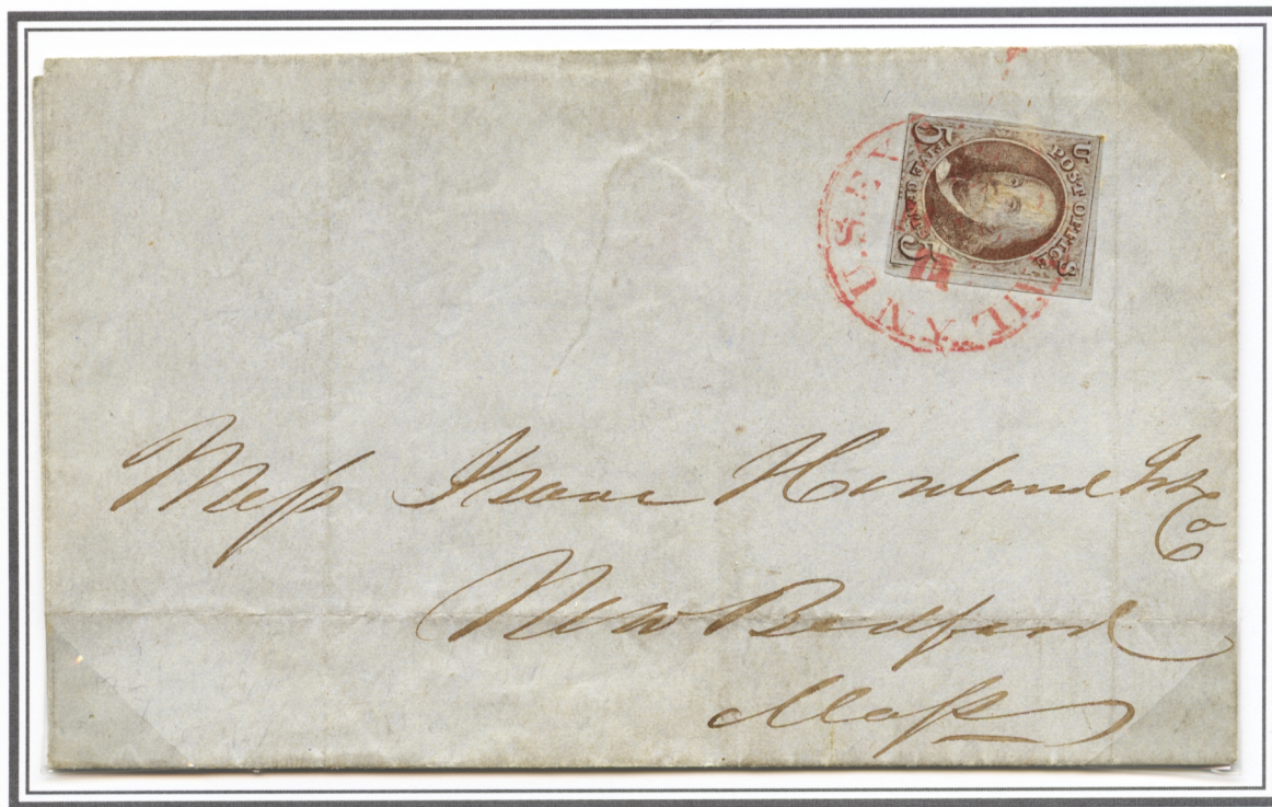
March 1850 cover from New York to New Bedford MA. Entered the mail on a train from New York City to Boston. U.S. Express Mail route agent datestamp

Express Mail route agents came about with the Post Office Department's attempt to compete with private express companies that were moving significant amounts of mail, ignoring the government's monopoly.