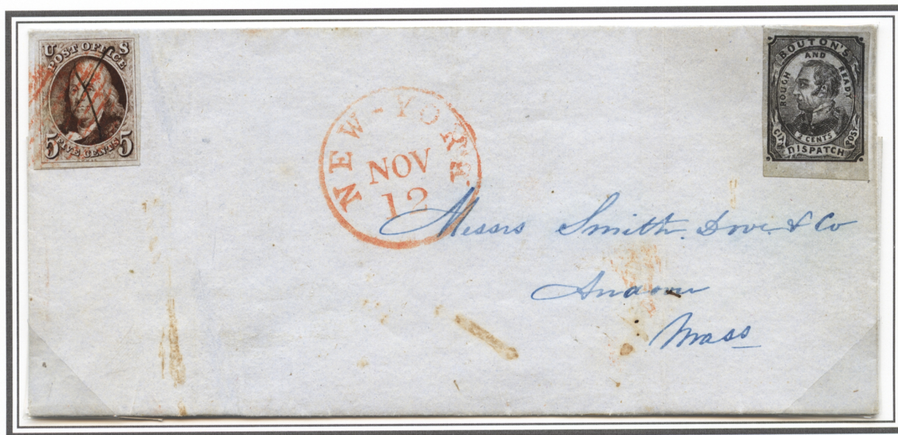
Nov 1848 folded address sheet from New York City to Andover MA. Local with corner dots (18L2) uncanceled. Bouton's delivered to the mail.