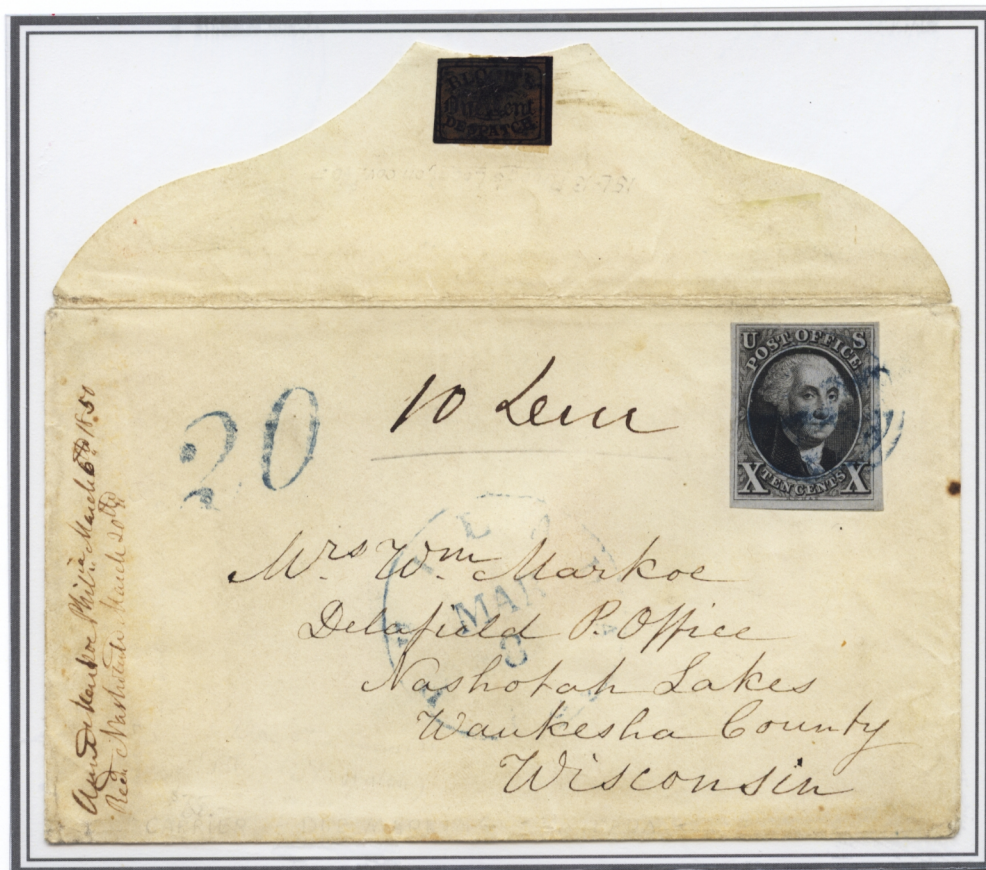
D. O. Blood's Despatch 1 cent black glazed bronze acid-tied on envelope flap. March 1850 cover from Philadelphia PA to Delafield WI. 10 cent stamp underpays the double rate, thus 10 cents due.