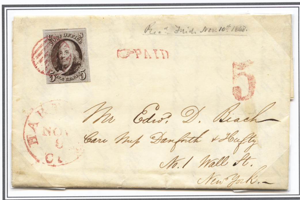
November 1848 folded letter from Hartford CT to New York City. Large '5' rate marking.