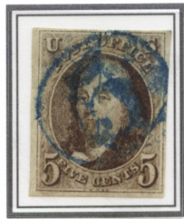
Blue '5' in circle Baltimore MD