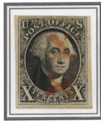
Two red 'X's