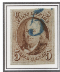
Blue fancy '5'