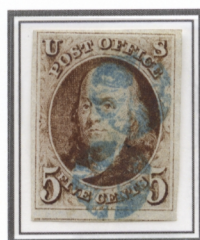
Two strikes of quartered cork