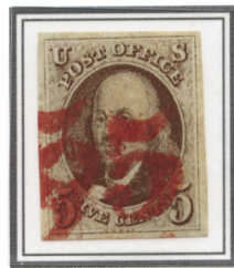
Double strike red '5'