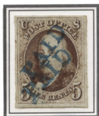
Two strikes blue 'PAID'