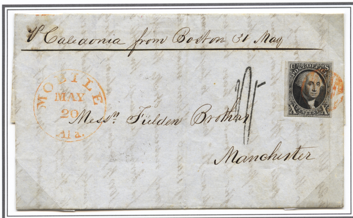
May 1848 folded letter from Mobile AL. 10 cent stamp paid postage to Boston. Orange town postmark. Orange grid cancels the stamp. The Caledonia sailed from Boston on 31 May, arriving in Liverpool on 14 June where the 1 shilling handstamp due marking was applied. The letter then traveled to Manchester, arriving on the 14th of June. Liverpool and Manchester datestamps on the back.