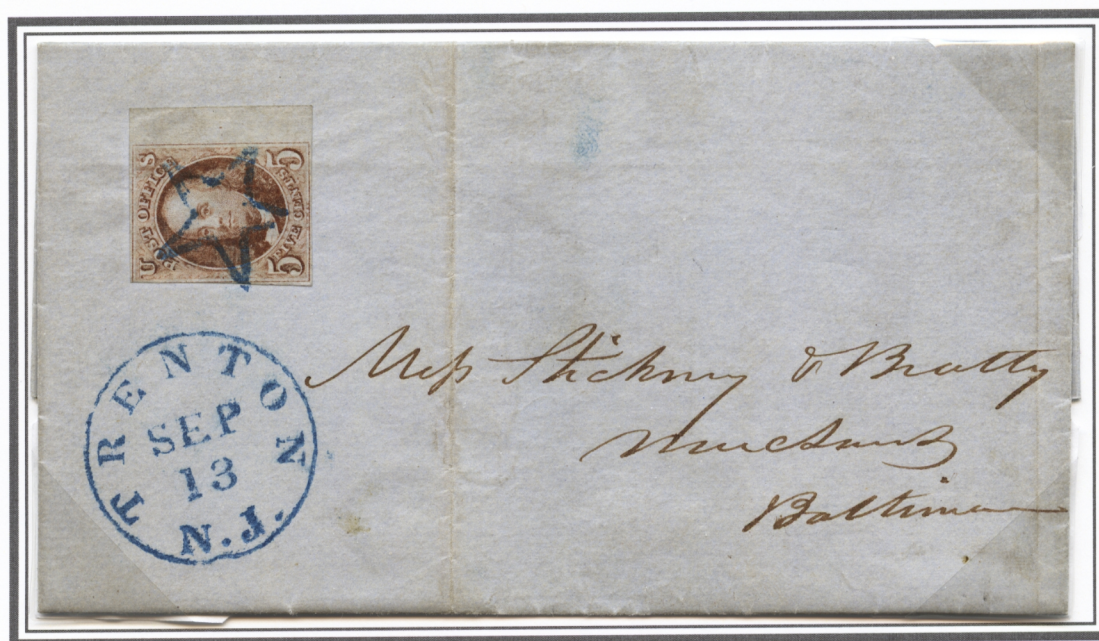
September 1848 folded letter from Trenton NJ to Baltimore MD. Trenton star cancel.

The 1847 stamps were usually cancelled with pen or with one of the standard devices. Some post offices used handstamps that were more often applied to stampless letters. A few post offices created non-standard "fancy" cancels from cork or wood, which were used exclusively to cancel stamps. Fancy cancels are very rare in the 1847 period, but became more common in the late 1850s and 1860s.