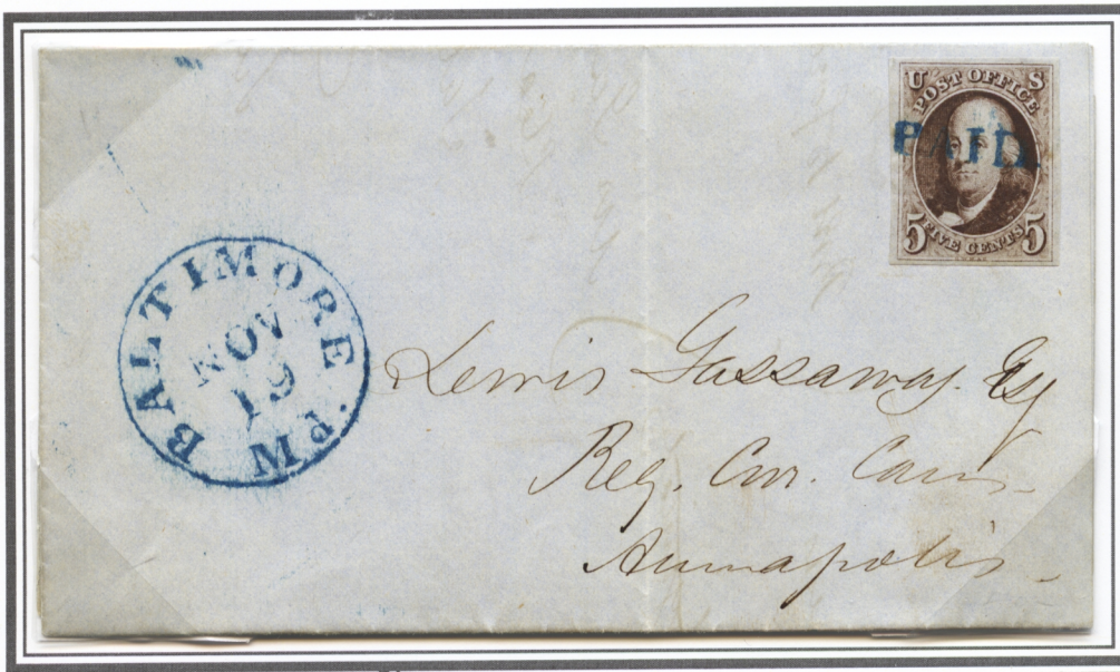
November 1847 folded letter from Baltimore to Annapolis MD.