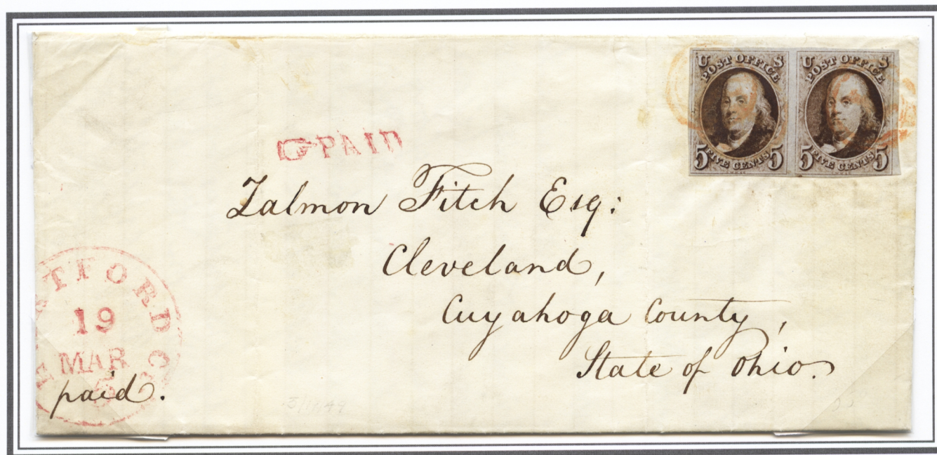
March 1849 cover from Hartford CT to Cleveland OH.