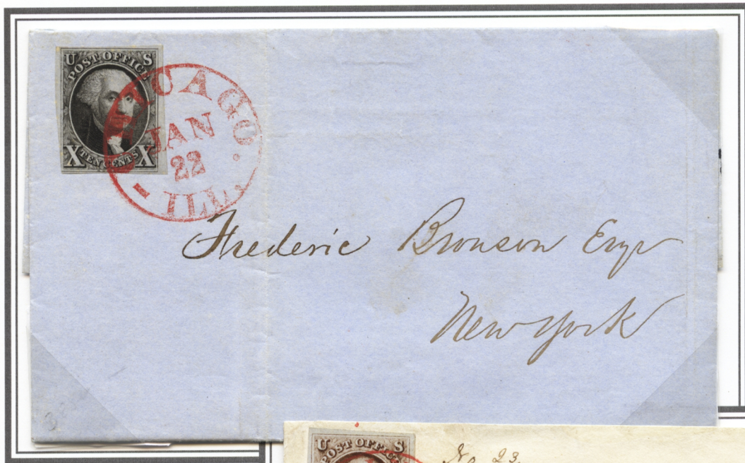
January 1850 folded letter from Chicago IL to New York City.

Post Office Regulations required that, in addition to killing the stamp, all letters needed to be marked with the town name and state as well as the month and day the letter was processed. Occasionally the postmaster did not use a killer but canceled the stamp with the town postmark.