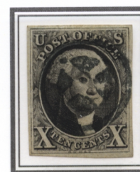
Quartered cork with three dots in circle