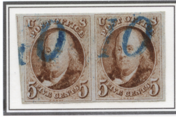
Two blue '10's