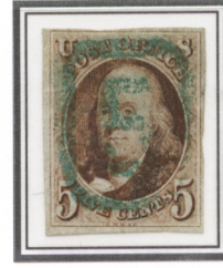
Green '5' in box Princeton NJ