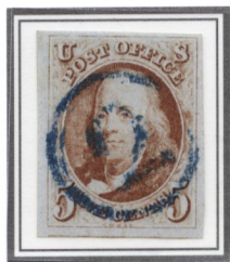
Blue '2' in circle Philadelphia PA