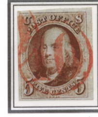
Red '10' in circle