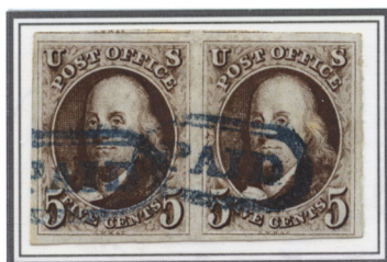
Blue Philadelphia 'PAID' in oval