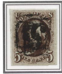
Black '5' in box Alexandria VA