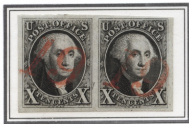
Two red '19's Positions 77-78L