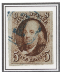
Blue '1' in octagon Philadelphia PA