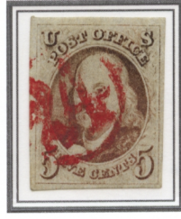
Red '24' in circle