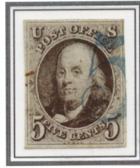
Fancy blue '5'