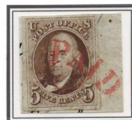
New York City red 'PAID' in arc on piece