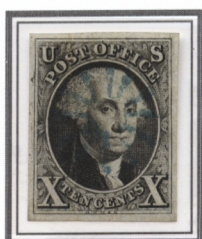
Blue circle of rays