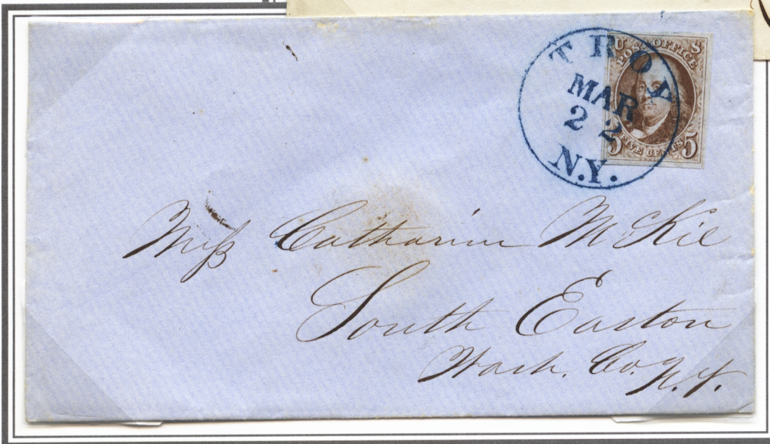
May 1849 cover from Troy to Champlain NY. Orange brown stamp.