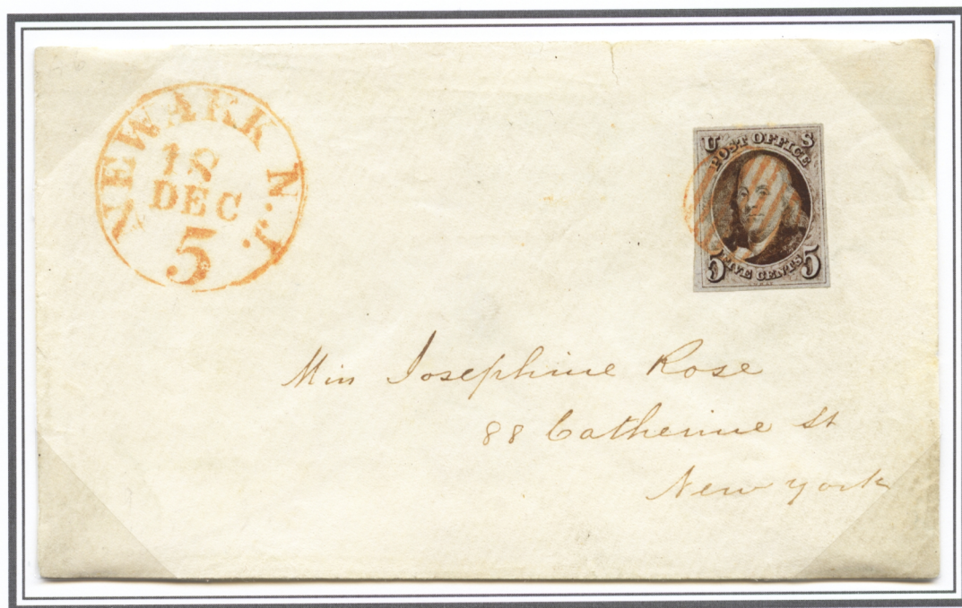
Cover from Newark NJ to New York City. Orange Newark integral rate town postmark.