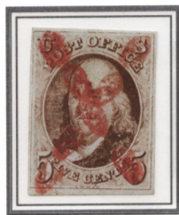
Roman numeral 'X'