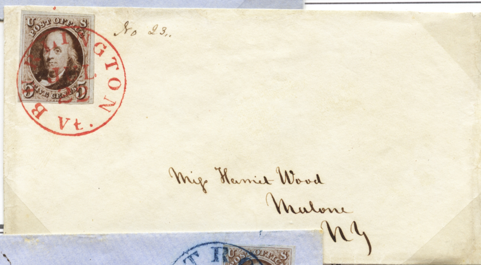
Burlington VT to Malone NY.