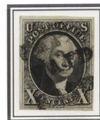
Two strikes black 'PAID'