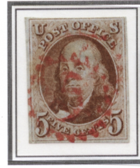
Red '5' in cogged circle Chicago IL