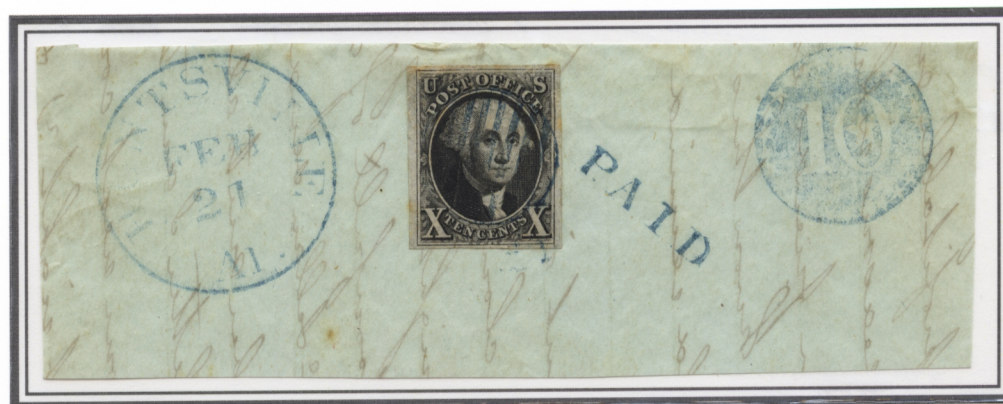
Huntsville AL negative '10' in circle of stars on piece. This marking is a pre-adhesive rate marking.

During this period fancy cancels were unusual. A few postmasters used non-standard devices and rate markings. In some cases pre-adhesive rate markings were used.