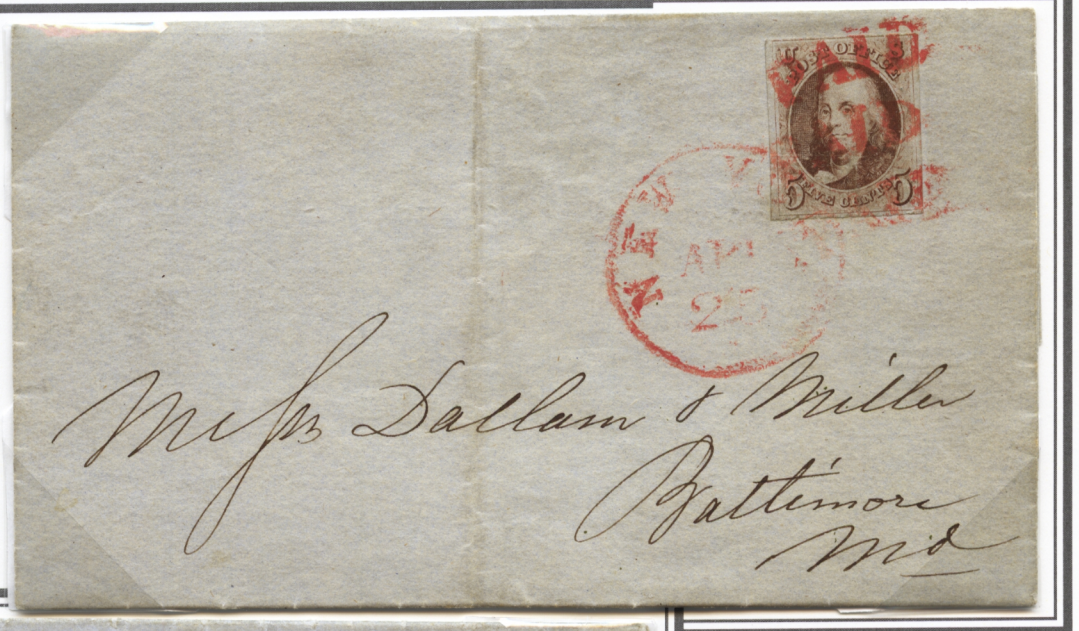
Three strikes of red 'PAID' in arc used to cancel stamp.