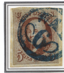
'Way 6' marking from Mobile AL on piece