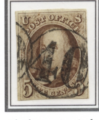
Black '40' in circle