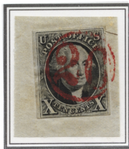
Red '20' in circle