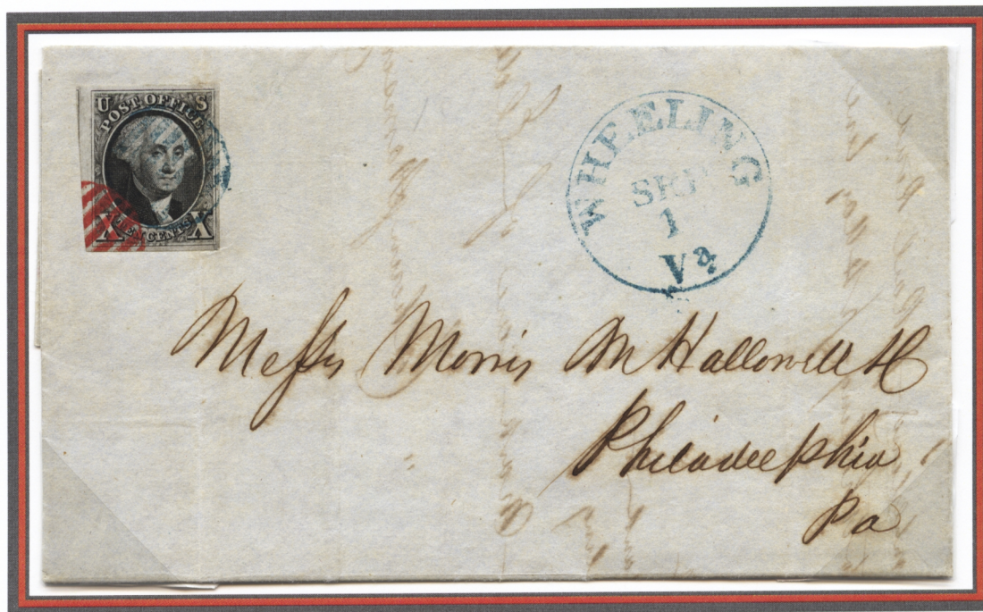
September 1847 letter from Wheeling VA to Philadelphia PA.

One of seven recorded covers with this control marking - four 10 cent and three 5 cent. Earliest recorded use of the Wheeling control marking.