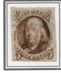
Red '40' in circle