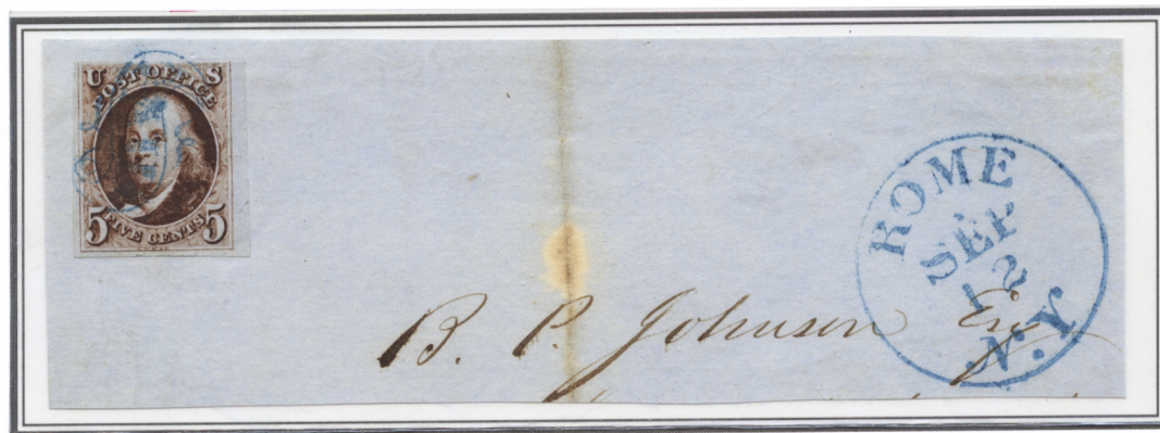
Fancy blue scroll 'PAID' cancel from Rome NY