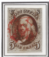
Red crisscrossed 'PAID' with octagon