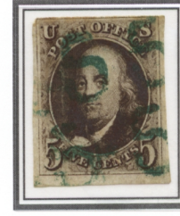
Four strikes of fancy green '5'