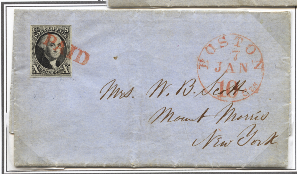
January 1850 folded letter sheet from Boston MA to New York City.