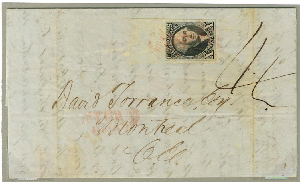
AU 17, 1850 New York City, NY to Montreal, CE (August 20) via Hudson River steamboat to Albany, NY. The stamp has an exceptionally large top sheet margin

The mark "STEAMBOAT" or "STEAM" indicates that the letter was picked up somewhere along an inland river, lake, bay or coastal sound by the captain or clerk of a vessel having no mail carrying contract. The captain was required by law to carry them to a Post Office where they entered the mail stream after being marked to indicate their origin.