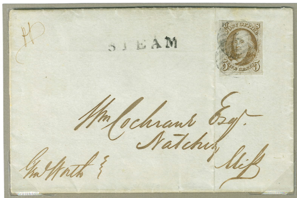
MR 14, 1850 Rodney, IA to Natchez, MS. Carried on the Mississippi River Packet General Worth . Dot in "S" variety.