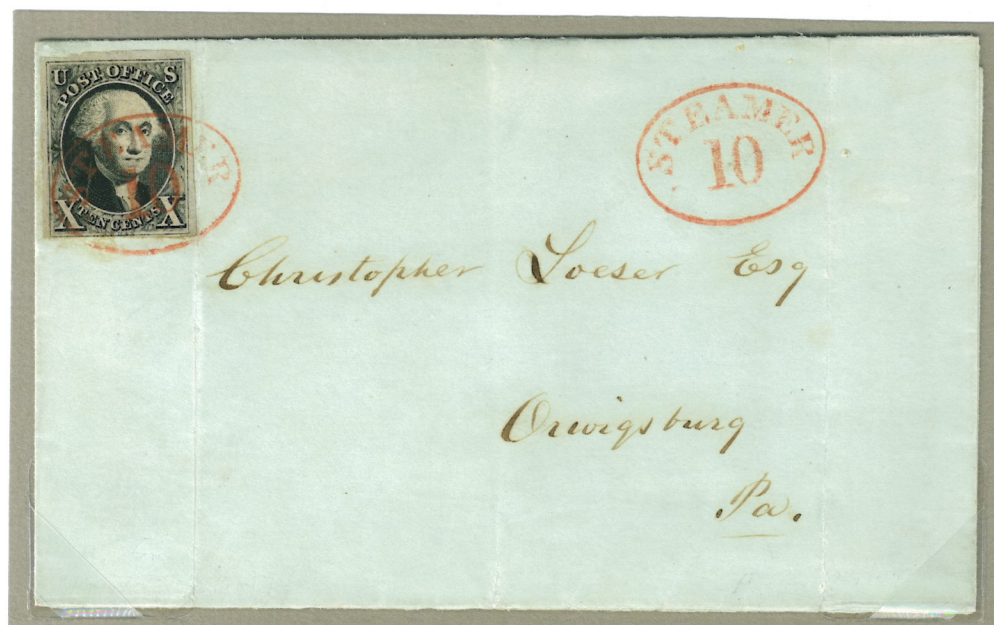
SE 1, 1847, Boston, MA to Orwigsburg, PA. e