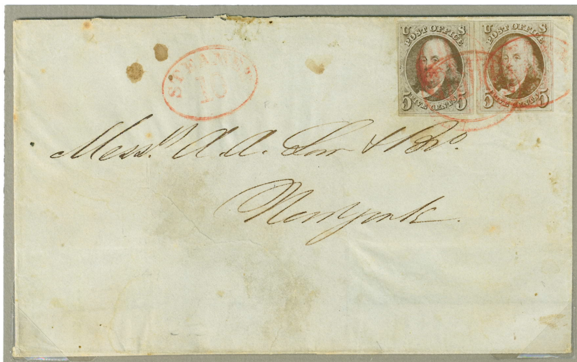
AU 20, 1847, Boston, MA to New York City, NY. – Earliest known use of the marking

The only two genuine covers recorded with this marking