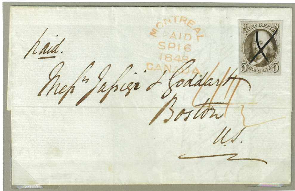
SE 16, 1848 to Boston, MA. e 4½d. < 60 miles and 5¢ < 300 miles.

Canadian postage prepaid in cash or unpaid US postage prepaid in cash, US stamps or unpaid