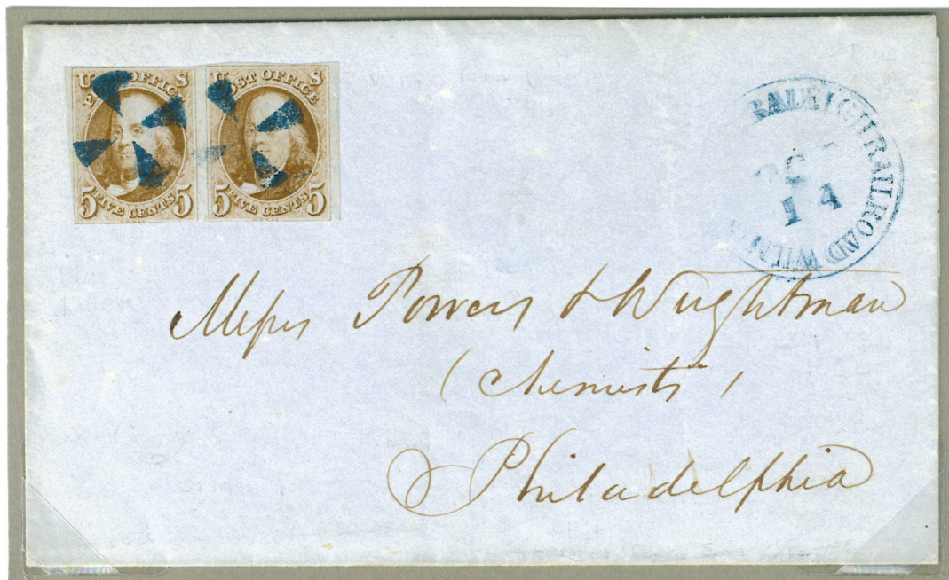
OC 14, 1850 to Philadelphia, PA. e Stamps supplied: 5¢ - 1,000 - Dot in "S" variety on left stamp. Route agents were assigned to this railroad as early as 1846 and possibly earlier as this was a section of "The Great Mail Route".