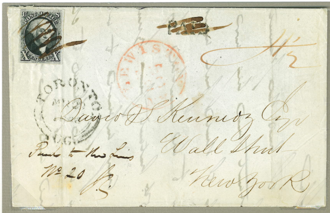
MR 20, 1849 to New York, NY. e 4½d. < 60 miles and 10¢ > 300 miles.