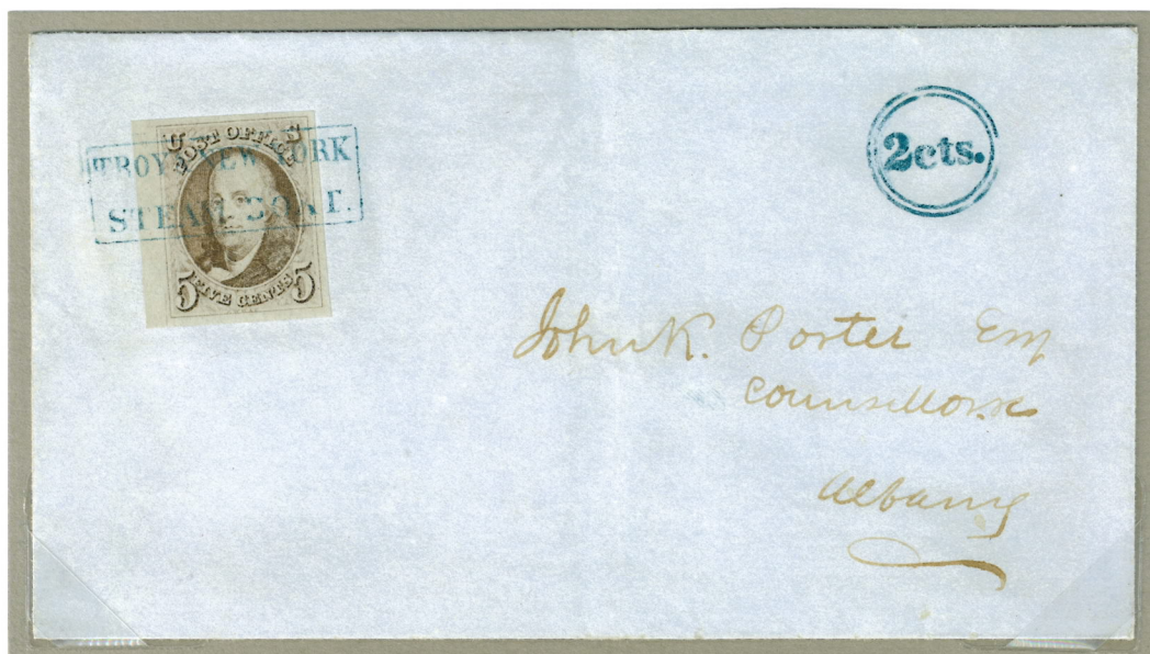
Undated to Albany, NY. e Marking applied at Troy where the letter entered the US mail system. Two-cent steamboat fee handstamp.