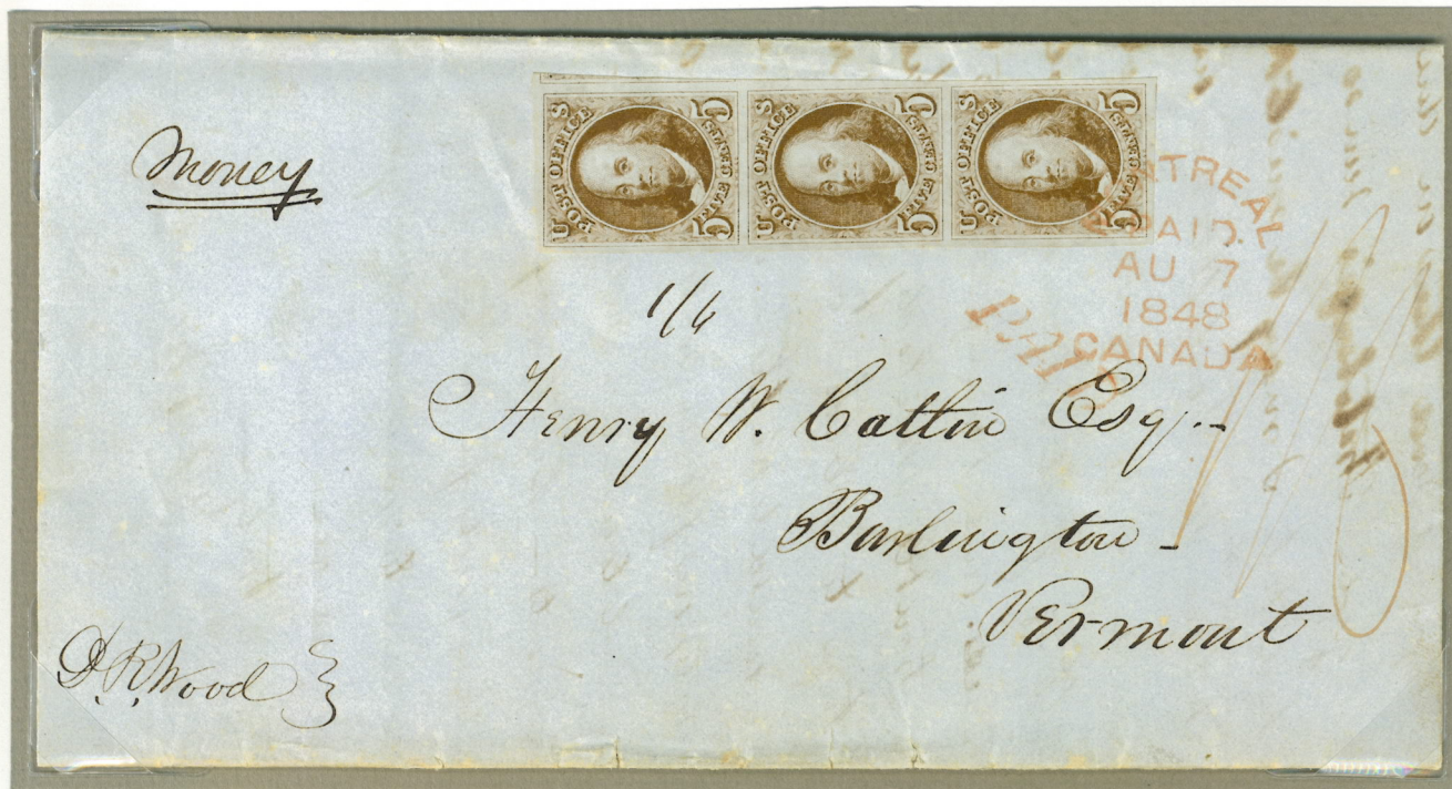
AU 7, 1848 to Burlington, VT. e Quadruple rate in Canada 1/6: paid in cash and triple rate in the US: 15¢ in stamps.

On June 5, 1845, Canada's Deputy Postmaster General Stayner published a table of rates showing that Canadian rates increased in full ounce increments while US rates increased by ½ oz. increments.