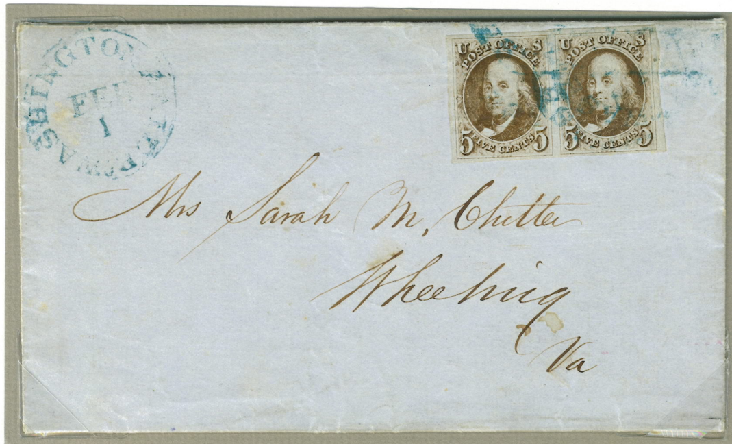
FE 1, 1851 to Wheeling, VA. - Stamps supplied: 5¢ - 1,300 / 10¢ - 250 Route agent service began in 1847 on this route.