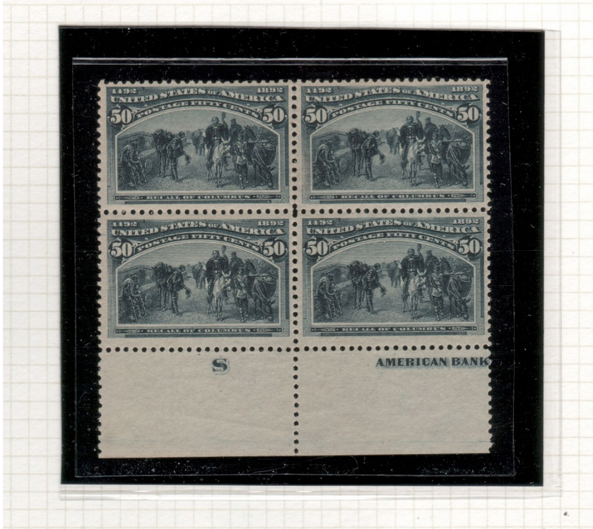
Fig.55a Partial Imprint S, Block of Four.