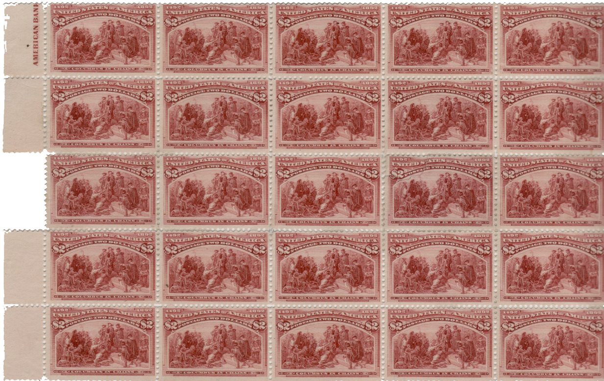
The Largest Known Multiple of the $2.00 Value Unused left sheet margin block of 25 with partial ABNC imprint.