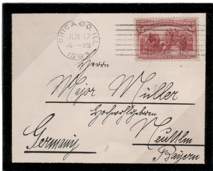
Mourning Cover The $2.00 Columbian used to Bayern, Germany in July, 1893.