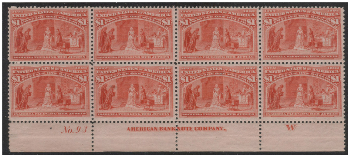
Fig. 61c Bottom Imprint, No. 93, W, Plate Block of Eight.