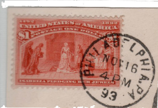
Philadelphia, Penna., Postmark