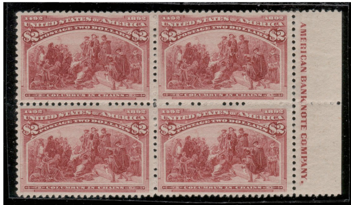
Fig.66a Margin imprint Block of Four