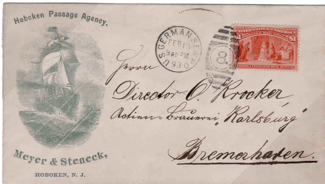
U.S. German Sea Post The $1.00 issue applied on corner card cover posted at sea on steamship bound for Bremerhaven, Germany. Feb., 1893.