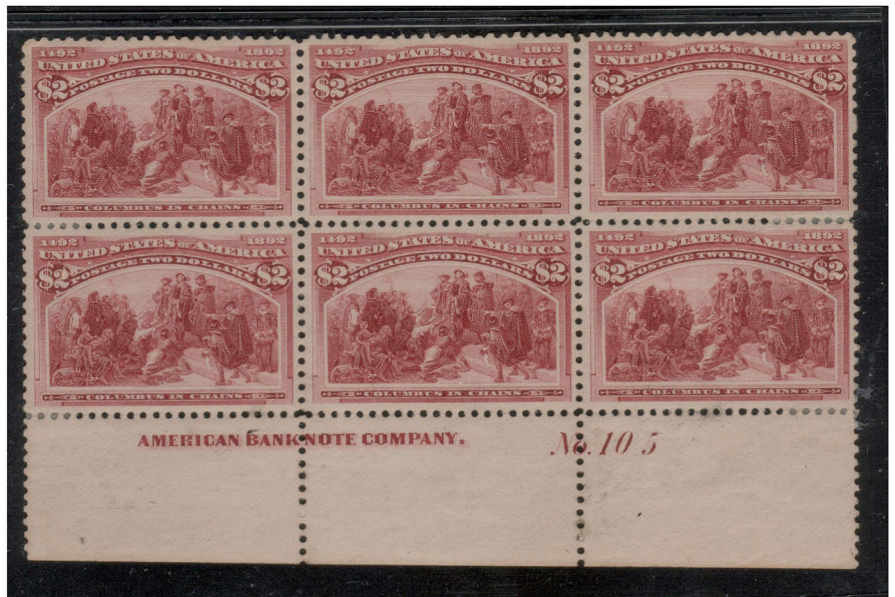
Fig.66b Margin Imprint, No. 105 Block of Six.