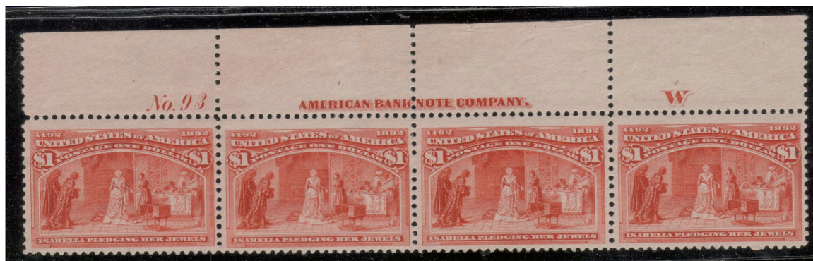
Fig. 61b Top Imprint No. 93, W, strip of four.