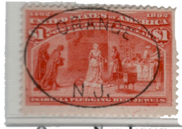
Orange, New Jersey Oval Postmark