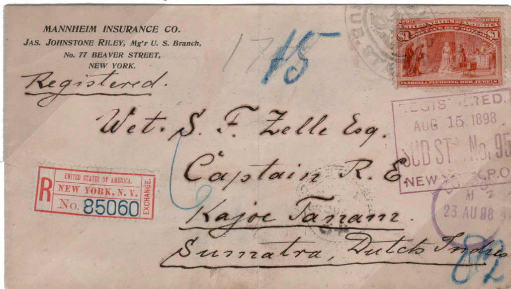
To The Dutch East Indies Single $1.00 Columbian on registered cover to Sumatra in August, 1898, from New York City. Transit through London.