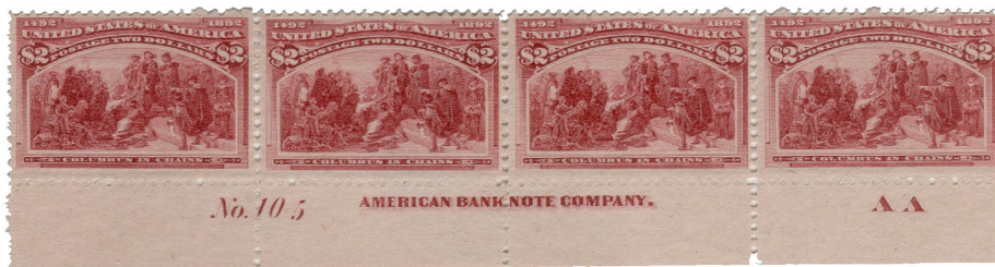
Imprint Strip of Four Unused bottom plate number imprint strip of four with ABNC imprint. Plate No. 105