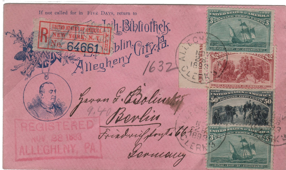
On Theater Corner Card Postage of $2.56 on registered theatrical cover to Berlin, Germany in November, 1893. Unusual "Allegheny Clerks" registry cancel.