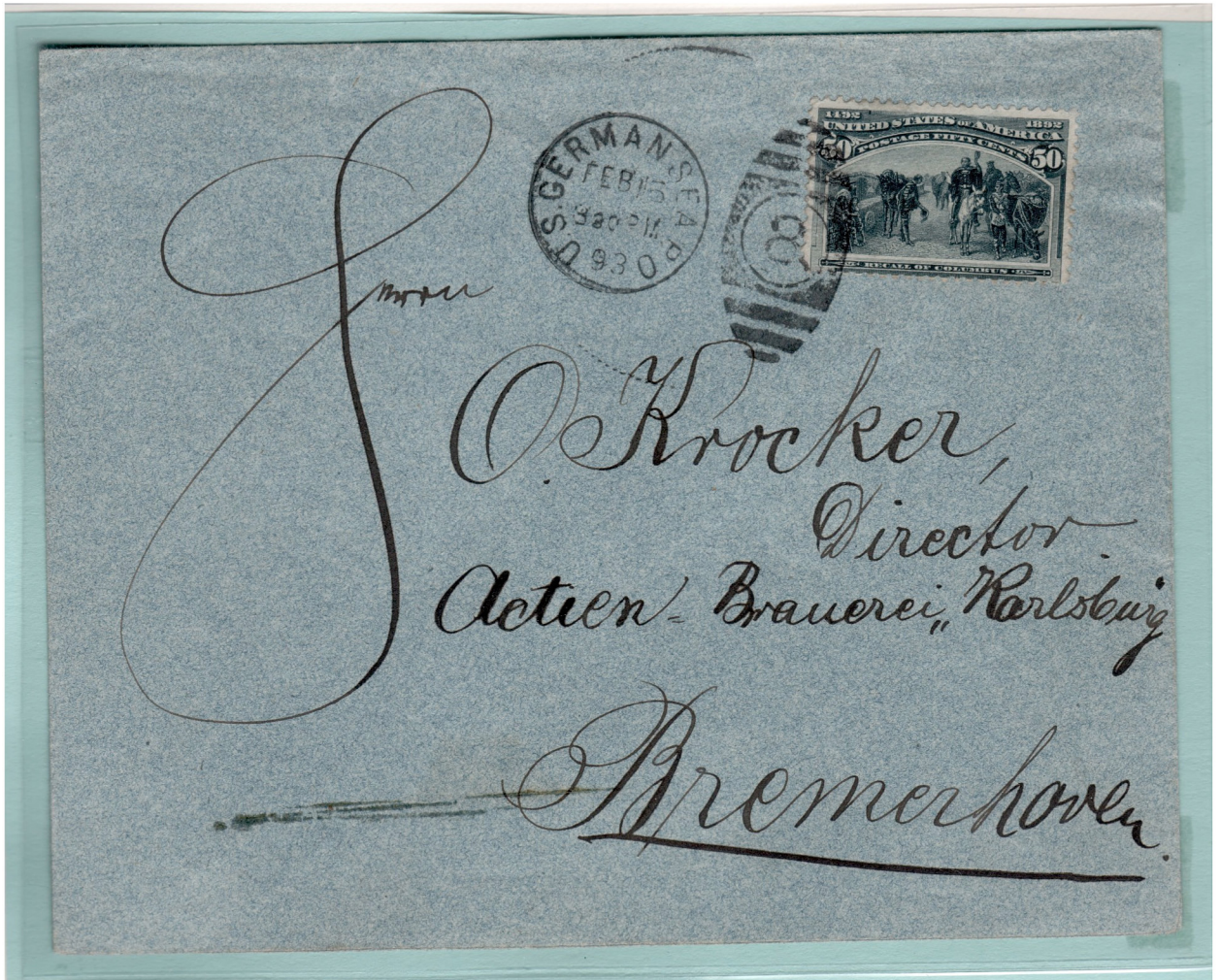
Fig. 56 U.S. German Sea Post, Feb. 1893.