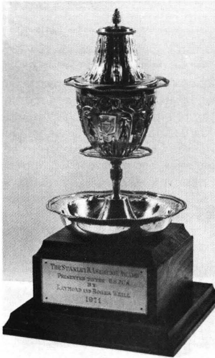
The Stanley B. Ashbrook Cup (1971)