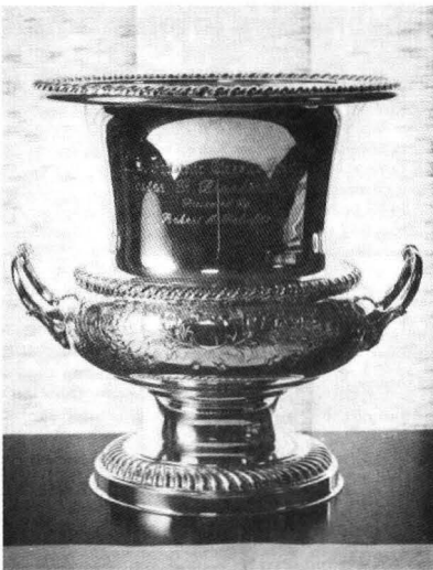
The Lester G. Brookman Cup