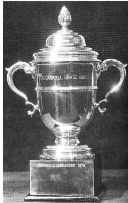
The Dr. Carroll Chase Cup